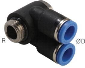
Double Branch A