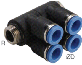
Double Branch A