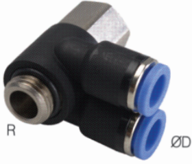
Dual Female Banjo