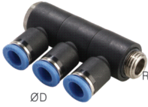
Triple Universal Elbow