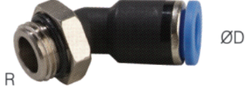
Male 45° Elbow