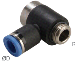
Extended Male Elbow