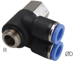
Dual Female Banjo